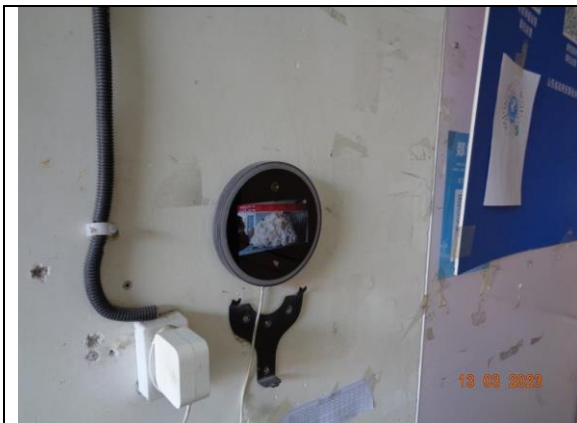
Electronic time recording machine