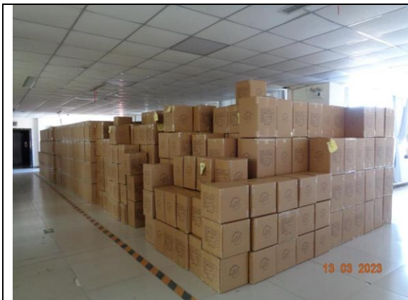
Finished products storage area