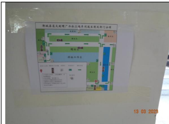
Evacuation plot plan